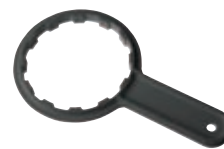
-IL- spanner available for IN LINE HOUSING CODE RB7403014