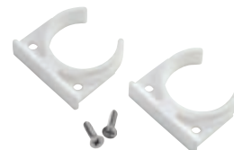
clips 60 mm with screws available for IN LINE HOUSING CODE RB6332000