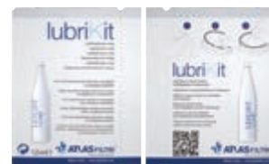
-LUBRIKIT- single-dose lubricant for housing o-ring CODE RE9020650