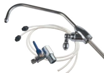
kit IN-LINE FILTER available for IN LINE HOUSING CODE LB7202135